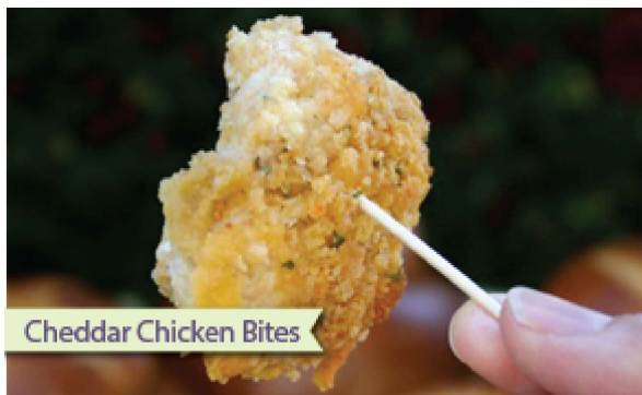
Cheddar Chicken Bites