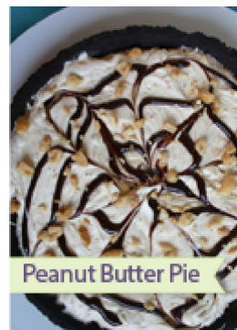
Peanut Butter Pie