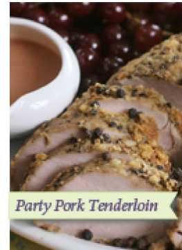
Party Pork Tenderloin