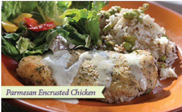
Parmesan Encrusted Chicken